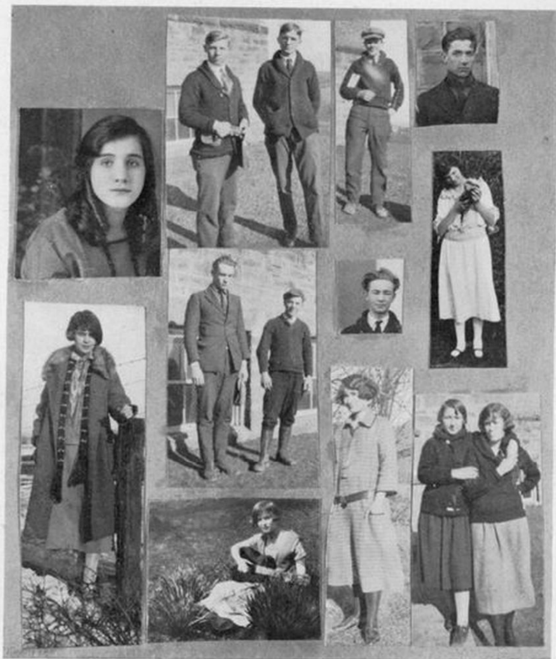
SENIOR SNAP SHOTS